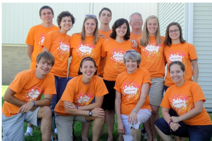
Left to-right / Back to Front

We are continually amazed at how God blesses us with such a wonderful opportunity to work with great college students with the Summer Intern Program. We have said it before and continue to believe that is perhaps the most important work we do! We are able to get to know and work with these students for 10 weeks, and so the relationships we build and the impact we can have on them is far greater than what happens during a week-long program. We were particularly blessed to know and work with this group and we pray God's blessings on them – the dream team of 2009!